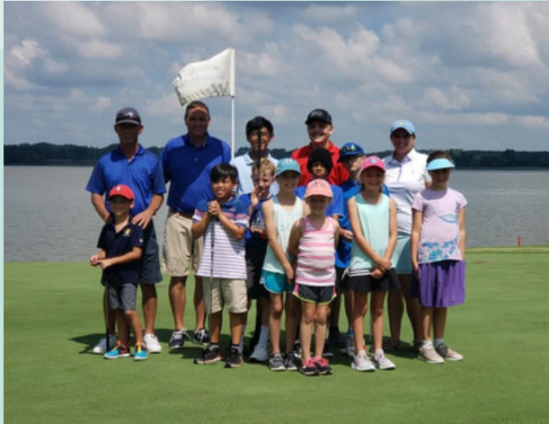
Past Junior Camps